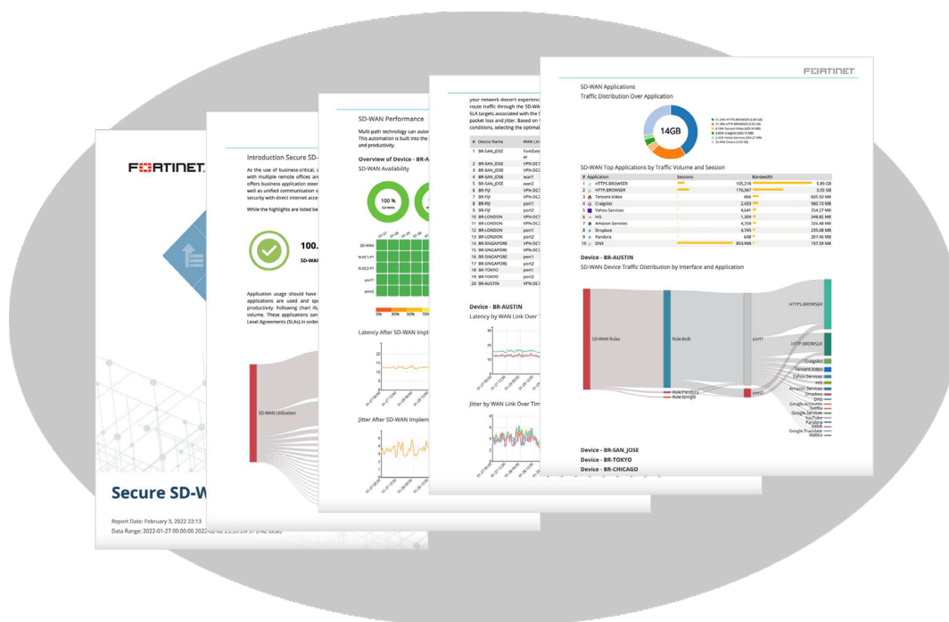
Figure 2: Detailed and highly configurable SD-WAN reports save the IT team valuable time.

Fortinet accelerates compliance reporting by simplifying security infrastructure and eliminating the need for many manual processes. FortiManager and FortiAnalyzer include customizable regulatory templates as well as canned reports for standards such as Payment Card Industry Data Security Standard, Security Activity Report, Center for Internet Security, and National Institute of Standards and Technology. They also provide detailed audit logging and role-based access control to ensure that employees can only access the information they need to perform their jobs.