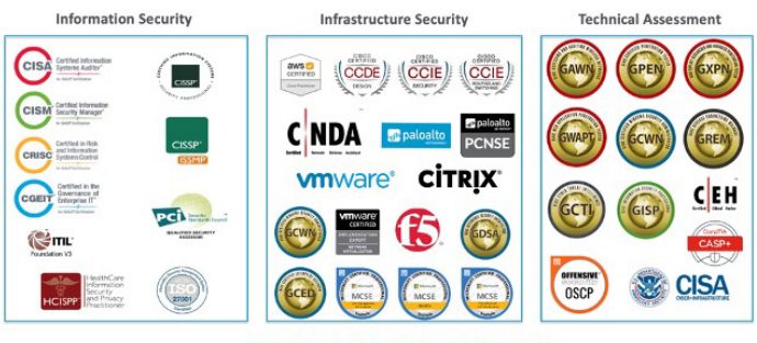
Experience, Education, and Expertise